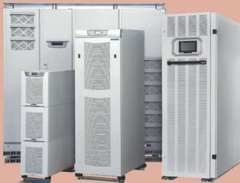
Eaton Marine Approved UPS Range (1-800kVA)