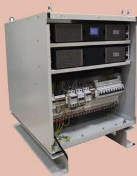
Eaton Marine UPS 1-3kVA