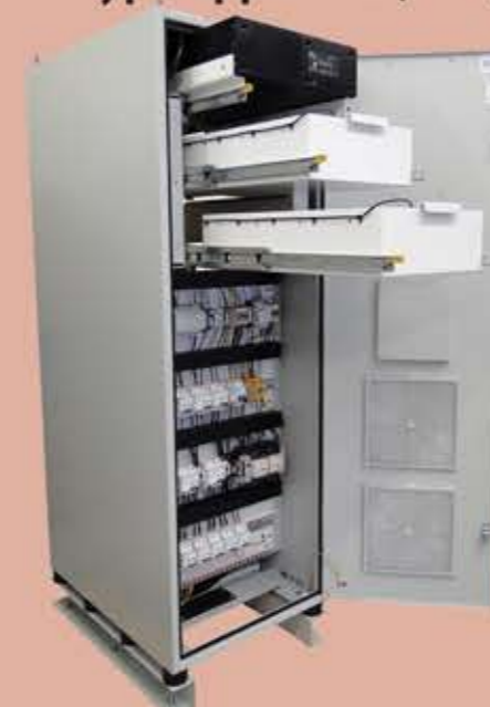
HS Marine Type Approved (MTA) 1-11kVA