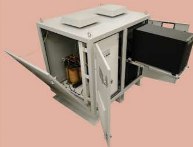
15kVA Naval UPS