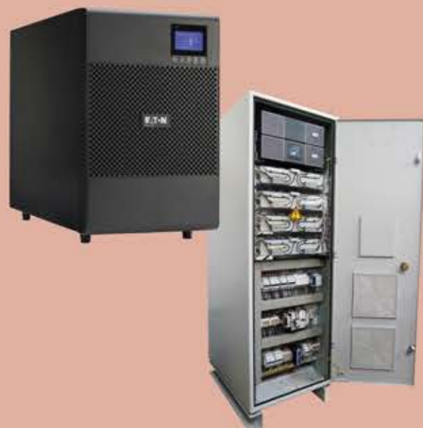
Eaton 9SX/9PX Marine UPS